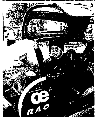
His Worship the Mayor meeting members of the 1st race of electric cars around the world, the ZERO RACE.